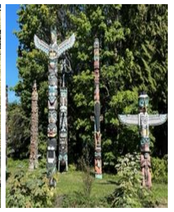
Fascinated by totem poles.

All in all a great convention meeting up with friends you only see once a year, making new ones. Enjoying the camaraderie of Hoo-Hoo fellowship, living the Golden Rule and of course you have to do all off the Business side as well.