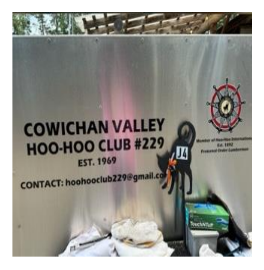
The Bar-B-Q van