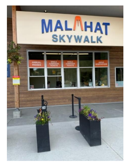
The JIV cat went on adventures and he was noted visiting the Malahat skywalk what a way to spend the afternoon.