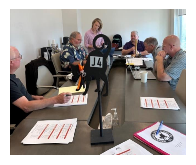
JIV Cat ready to start Board meeting.

The convention started with the Snarks Reception on Friday night. Followed by the HHI Board Meeting. There was Whale watching or a Sawmill tour that the conventioneers could do.