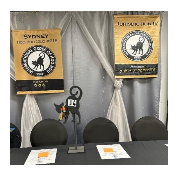
The AGM was on Sunday and we started with the flag presentation –JIV was there with its banners