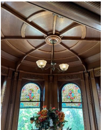
Beautiful - the craftsman work is just extraordinary.